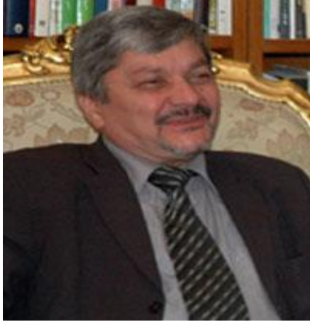
Mr. Bahr Al-Olom Previous Minister of Oil