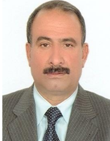
Mr. Karim Aftan Minister of Electricity