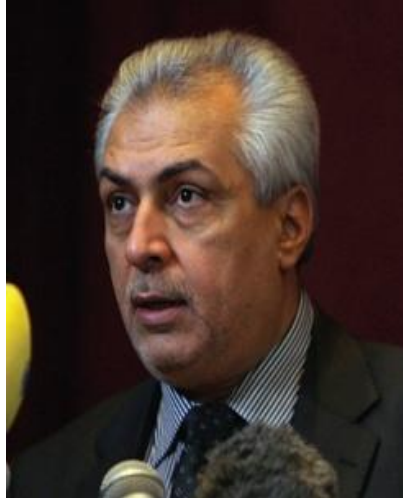
Mr. AbdelKarim AL-Aaiby Minister of Oil