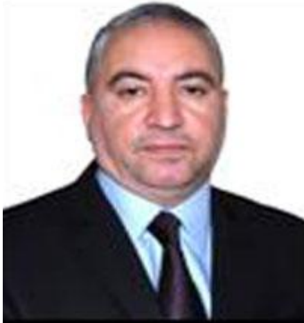
Mr. Muhaned Salman Al-Saadi / Minister of Water Resources