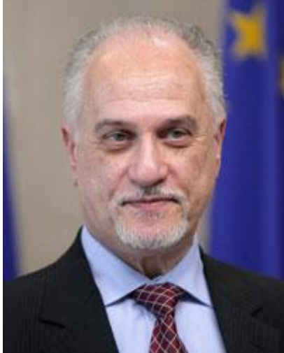
Dr. Hussain Al-Shristani /Vice Prime Ministry of Energy