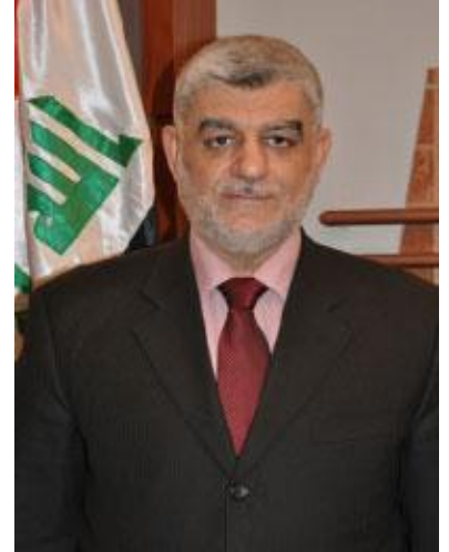
Mr. AbdelKarim Ali Yassin / Minister of Science & Technology